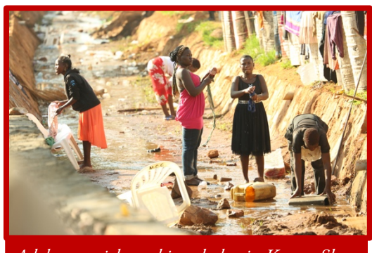
Adolescent girls washing clothes in Kosovo Slum

Interning in Uganda will be an extremely rewarding experience for the interns. We offer students an opportunity to demonstrate their generosity and make a difference in the lives of people that need it most. It takes so little to impact communities and transform lives in Uganda and interns will see the immediate results of their work. Our internships are life changing not only for the communities in which the interns serve but for many students as well. Living in Africa makes interns realize how they take so much for granted. Many students are transformed by these experiences and they develop an extraordinary sense of humility, compassion and return home humbled and with a greater appreciation of life.