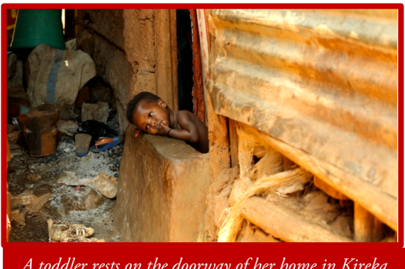
A toddler rests on the doorway of her home in Kireka